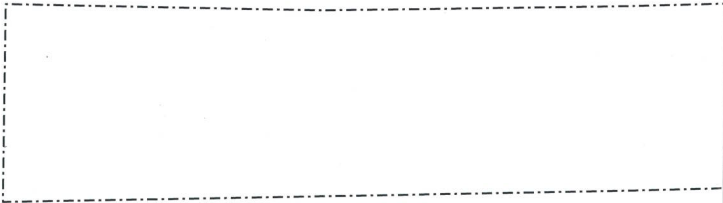
EXISTING ROOF PLAN 1:100